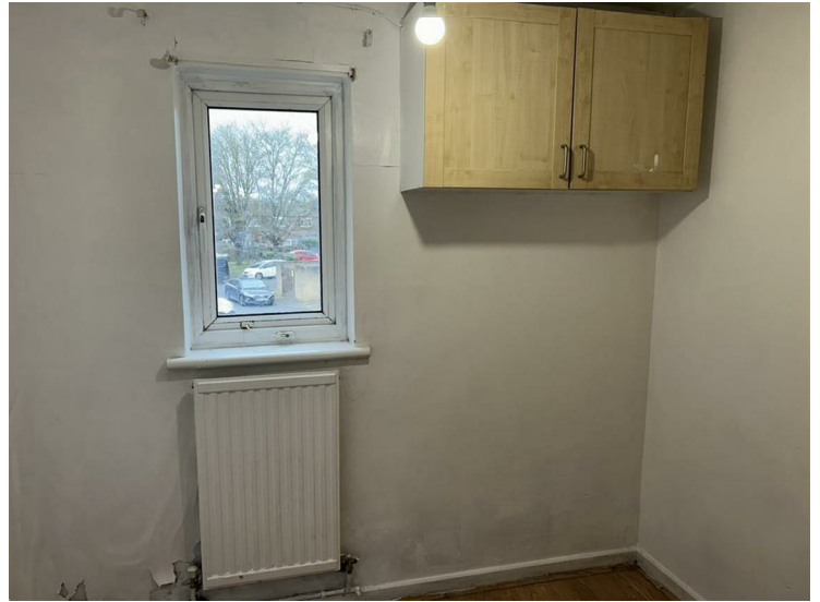
Front aspect double glazed window, radiator.