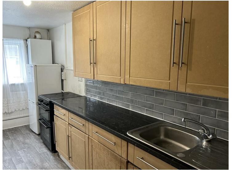
Single drainer sink unit with mixer tap and cupboard below, further range of wall and base units, plumbing for washing machine, space for cooker and fridge/freezer, wall mounted boiler, radiator.