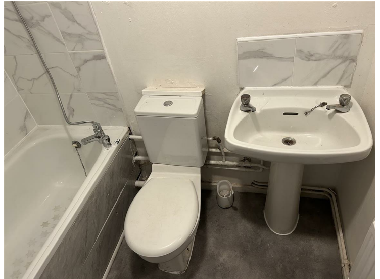
Panel closed bath with mixer tap, low level w/c, pedestal hand wash basin, part tiled walls, laminate flooring, extractor fan.