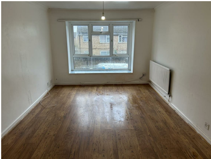
Double glazed window, radiator.